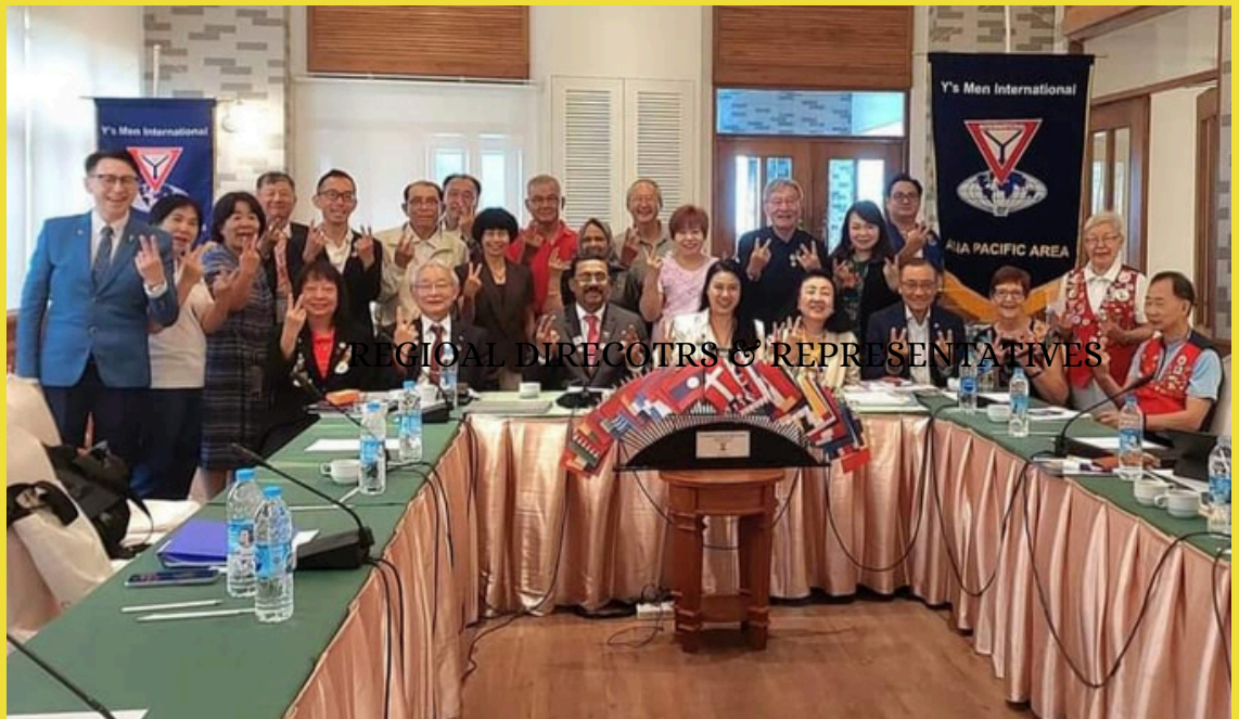
REGIONAL DIRECTORS & REPRESENTATIVES