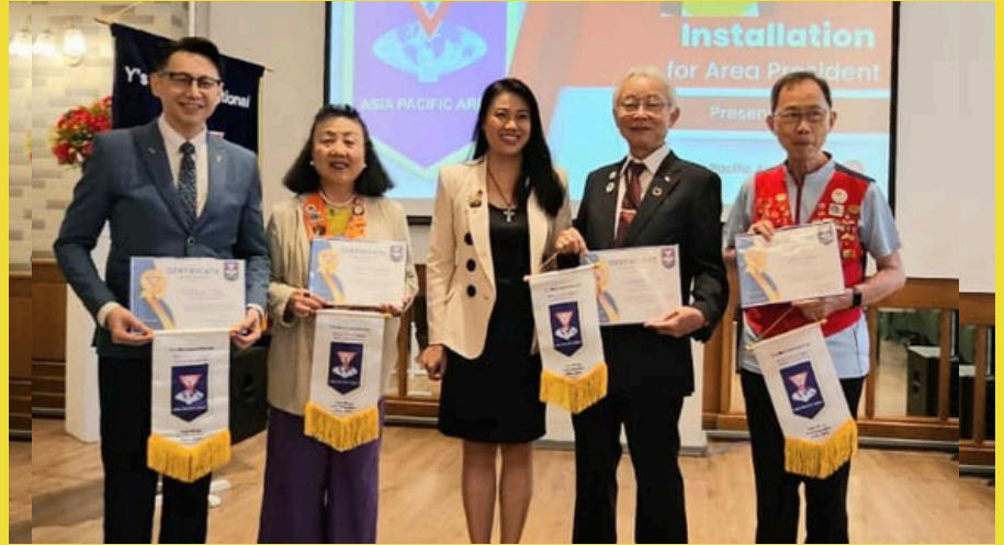
Area Executive Officers