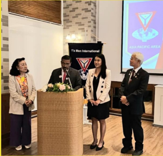
Area President Installation